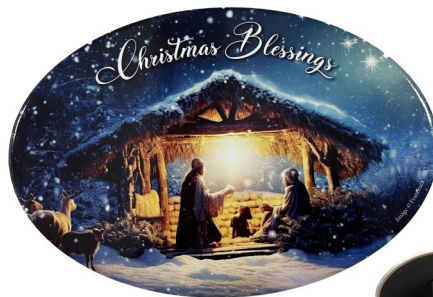
Back - Hang or Stand